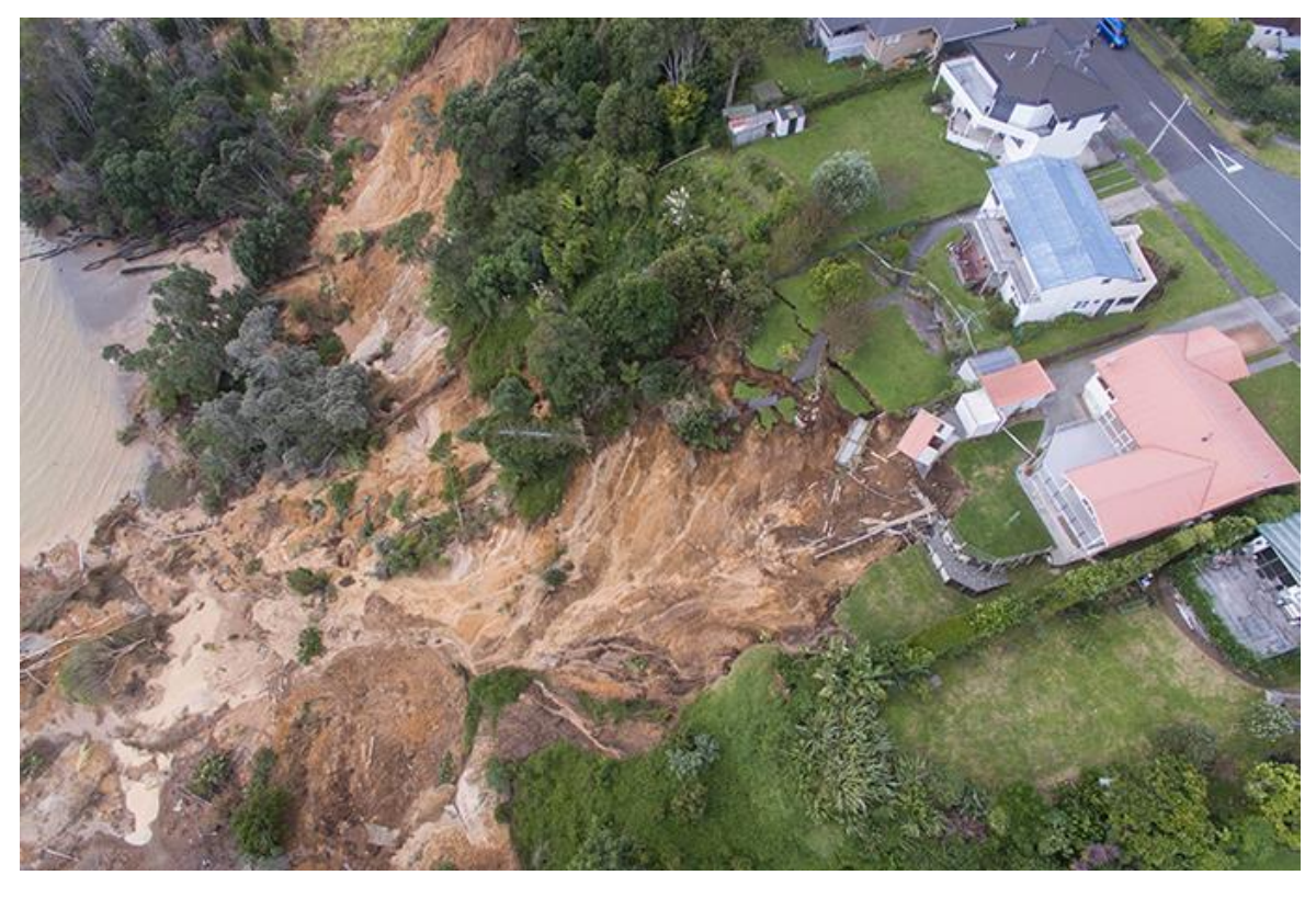
Maungatapu Slips 2022.

In December 2020 there was forest fire on Matakana Island that billowed a large amount of smoke towards the Ōtūmoetai area. This posed a risk of smoke inhalation. Bush fires are also occurring more frequently with the number of green spaces that we are creating within our cities.